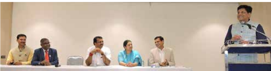
Shri. Piyush Goyalji (Cabinet Minister of Railways & Commerce, India) addressing the meeting