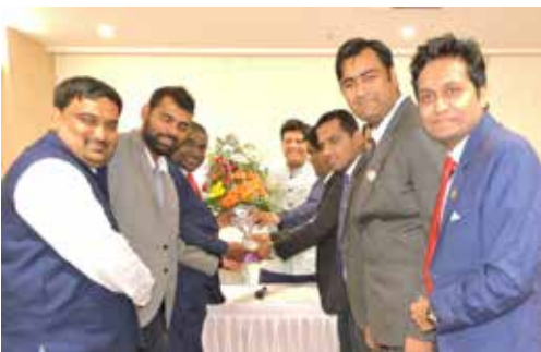
Committee Members of Vasai Branch of WIRC presenting bouquet to Shri. Piyush Goyalji (Cabinet Minister of Railways & Commerce, India)